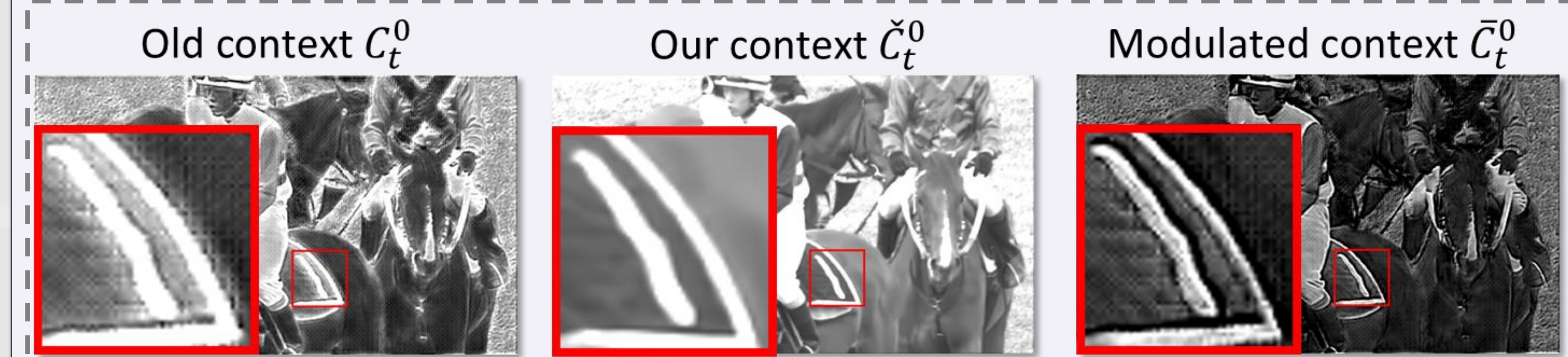
Visualization of Different temporal contexts